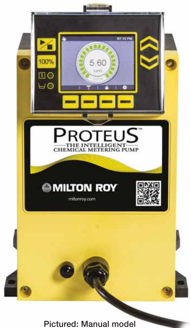
Pictured: Manual model

Selecting the right pump just got easier. No complicated configurations are necessary to find the right pump. With the Manual, Enhanced, and Communications models offered, simply pick the features that fit your needs (see page 6 for a complete list). Our models offer a wide range of functionality including backlit display, multilanguage, and 2-way communication to name only a few.