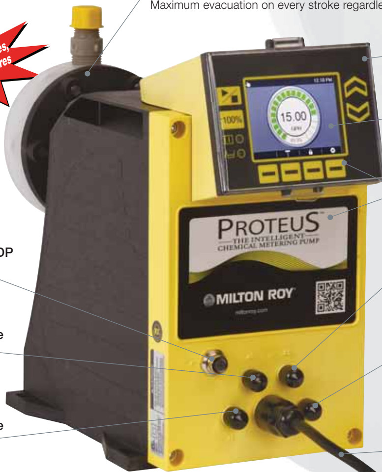
Pictured: Communications model